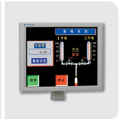
Vesa mount monitor – NEMA 1 Rated Features steel reinforced chassis for industrial environments

Bulletin 6176M Standard Monitors now feature Windows 7 Pro 64 bit support