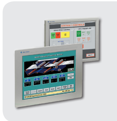
6176M/1950M Industrial Monitors